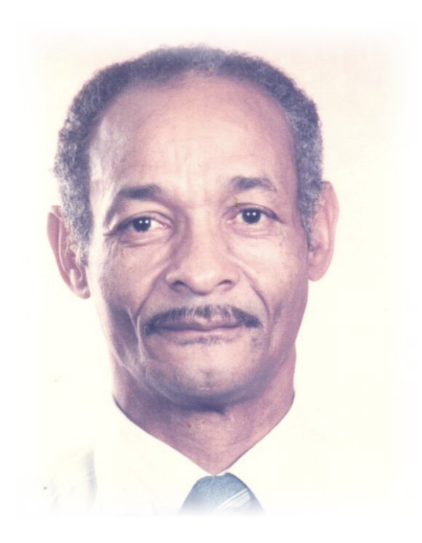
Saturday, December 24, 2011 One O'Clock PM